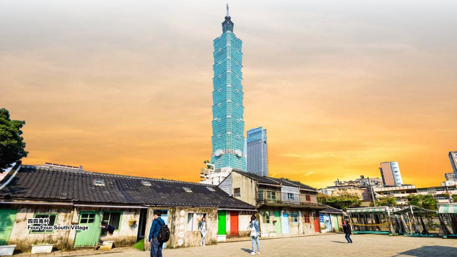
四四南村 Four Four South Village