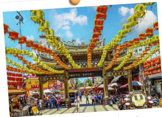
鹿港小镇 / Lukang Old Street