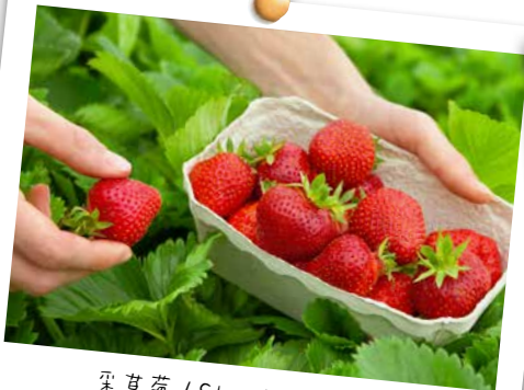
采草莓 / Strawberry Picking