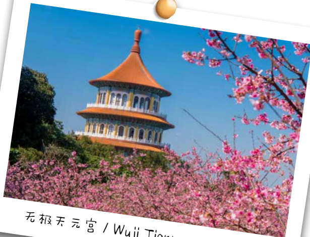
无极天元宫 / Wuji Tianyuan Temple