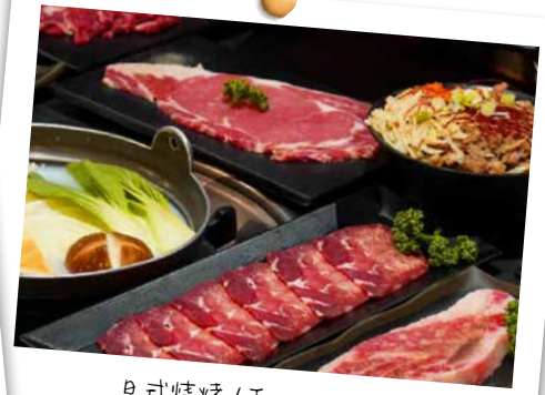
日式烧烤 / Japanese BBQ