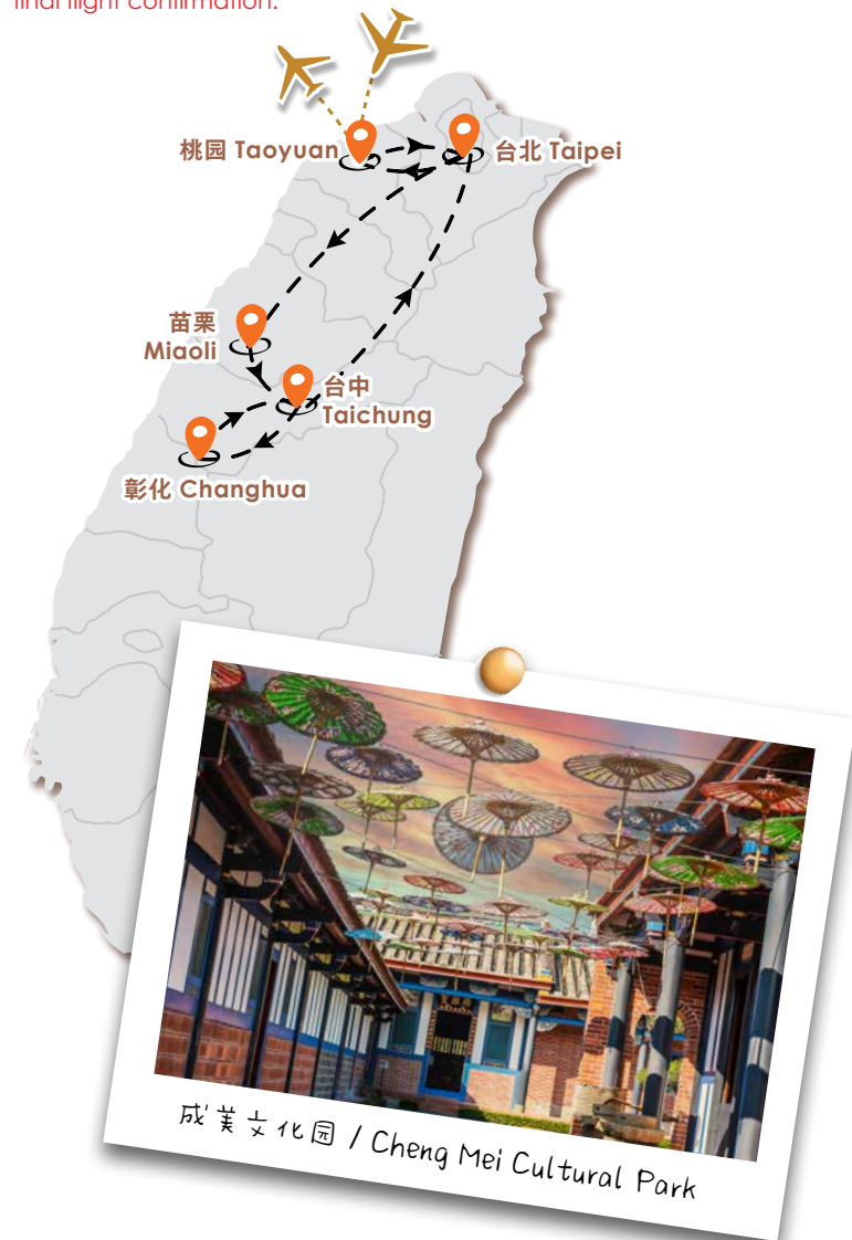
成美文化园 / Cheng Mei Cultural Park

※ Sequence of the itinerary is subject to change according to the final flight confirmation.