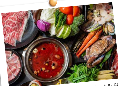
新千叶火锅自助吃到饱 (C餐) / Steamboat Buffet