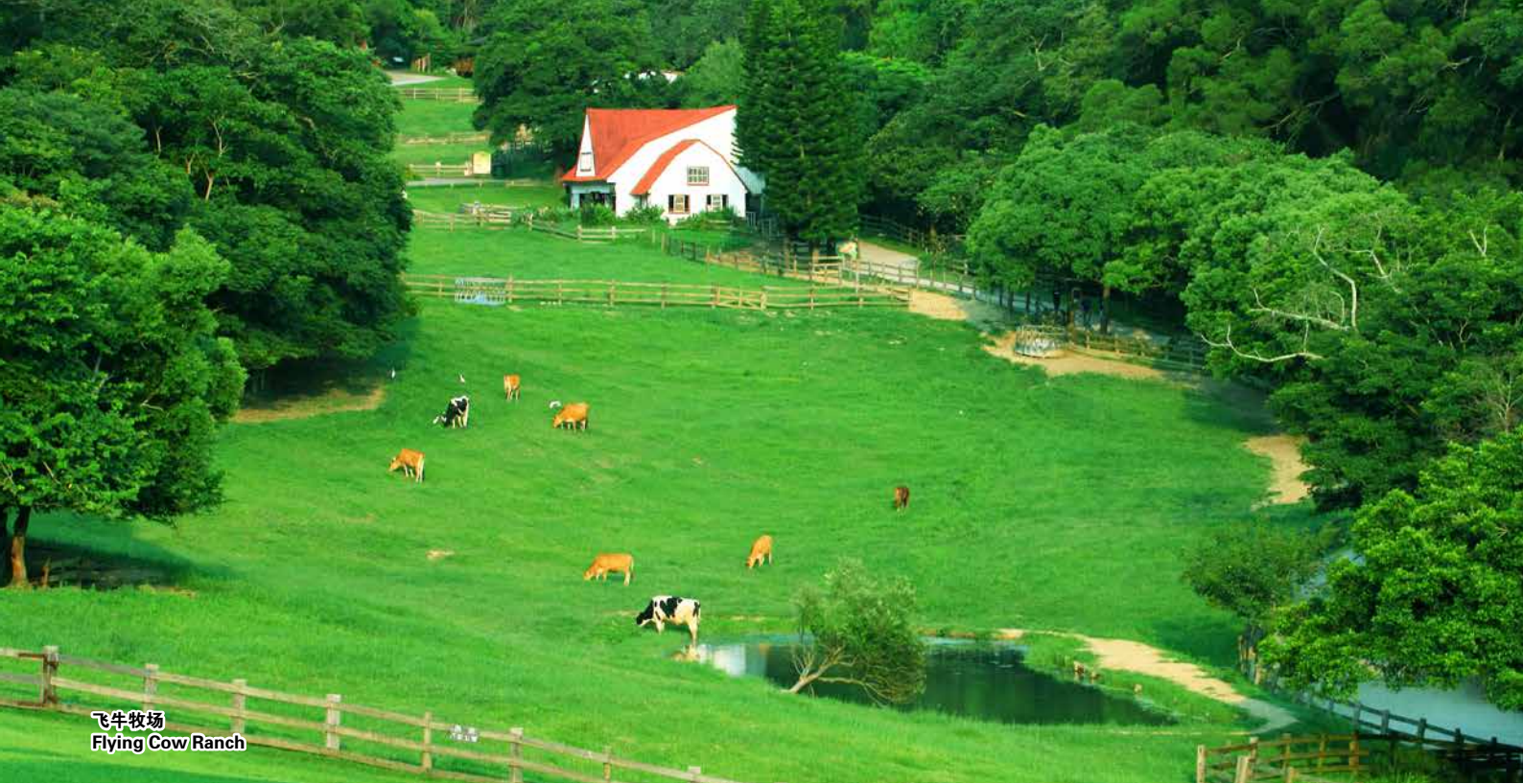
飞牛牧场 Flying Cow Ranch